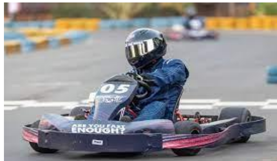
Figure 1: Go kart racing

A race track is a facility built for racing of vehicles, athletes, animals. Race track also may feature grandstands or concourses, a race track is a permanent facility or a building, circuit is common alternate term for the race tracks, given the circuit configurations of most of the race tracks, allowing races to occur over several laps. Some tracks may also be known as speedways or race ways. Many sports usually held on race tracks also can occur on temporary tracks, such as the Monaco Grand Prix in Formula One [1] . Outdoor tracks can offer low-speed karts strictly for amusement (dedicated chassis equipped with low powered four-stroke engines or electric motors), or faster, more powerful karts, similar to a racing kart, powered by four-stroke engines up to 15 hp (11 kW) and, more rarely, by 2-stroke engines, but designed to be more robust for rental use. Typically, outdoor tracks are also used for traditional kart races [3] . One such innovative way of constructing the racing circuit is, by developing the racing track by using paver blocks which is itself is produced by unique technology used in construction, also reducing the cost of the track to 1/3 of conventional track making more feasible for entertainment parks to implement.