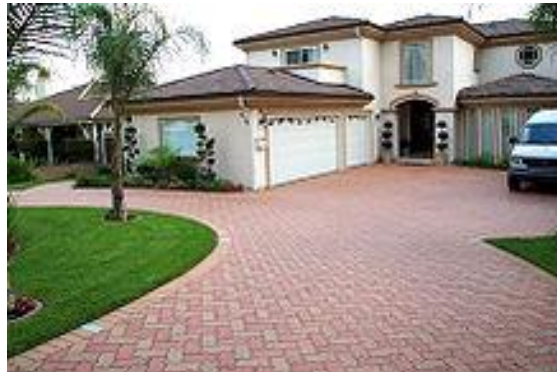
Figure 2: Interlocking pavers

An interlocking concrete paver is a type of paver. This special type of paver, also known as a segmental paver, has emerged over the last couple of decades as a very popular alternative to brick, clay or concrete [8]. An interlocker is a concrete block paver which is designed in such a way that it locks in with the next paver. The locking effect allows for a stronger connection between pavers and with this interlocking effect the paving itself is resistant to movement under traffic.